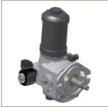
Hydraulic pump with integrated pressure filter

Reducing complexity, cost, and responsibility goes hand in hand with more compact solutions and the supply of complete pre-assembled kits does not only simplify the supply chain, it also contributes to absolute clarity related to product liability.